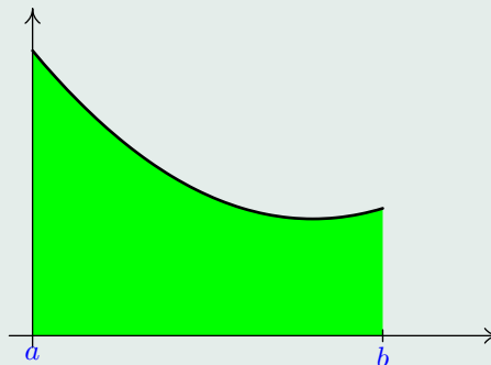
Figure 1: Floating figure